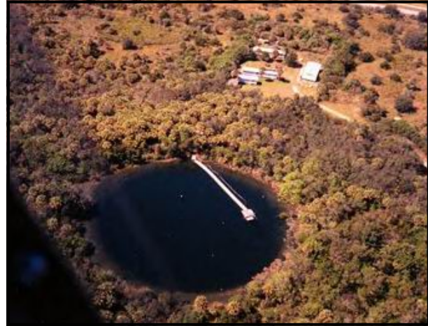
Little Salt Spring, Florida.

The upper basin slopes at 25° to 12 meters in depth where a roughly circular opening 25 to 30 meters across occupies the center of the depression. Below this opening, the walls are generally overhanging with two prominent encircling ledges at depths of 18 and 26 meters below the surface. About half way down, the sides begin to slope outward to form an inverted funnel. At its base, the sinkhole is about 60 meters in diameter with a water depth of 72 meters near the center, but the floor slopes downward around the perimeter to unknown depths. The bottom of the spring, as well as the upper basin, is covered with several meters of soft detritus and organic sediments.