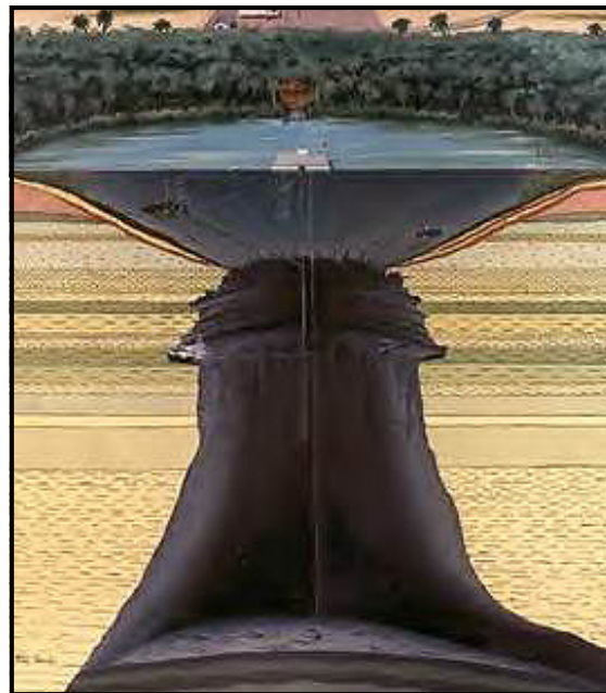
Artist's Cross Section of Little Salt Spring, Florida.

Gifted to the University of Miami in 1982, Little Salt Spring was first recognized as an archeological site in the late 1950s. The spring is fed from an underground source that has no dissolved oxygen in the water. Consequently, bacteria cannot grow and decompose wood and other organic materials, offering unique artifact preservation.