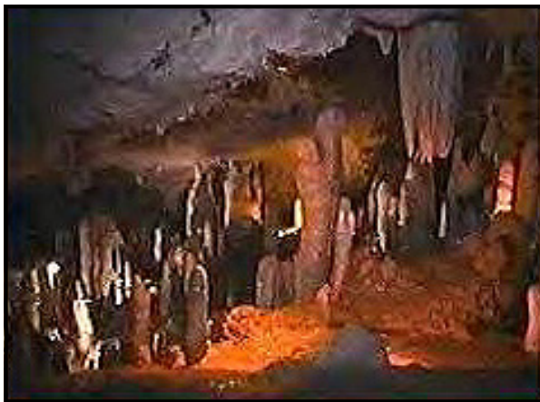
Harrison's Cave, Barbados

Harrison's Cave, Barbados – A 31 million-dollar project has been launched, to assist in the redevelopment of Harrison's Cave. Dubbed "De Heart uh Barbados", the program is also geared towards generating financial and social benefits for people living near the cave. Speaking last night during "De Heart uh Barbados" awards presentation ceremony, at the environmental special projects unit, in Sturges St. Thomas, Minister of the Environment Elizabeth Thompson, said that as a result of the proposed plans visitors to the cave will soon see a new and improved product. Minister Thompson said in addition to a farm and craft market, the redeveloped cave will include a water treatment plant, recycling of grey water and rain water for irrigation purposes, extensive composting and solar power, to provide 30 percent of the cave's power requirement.