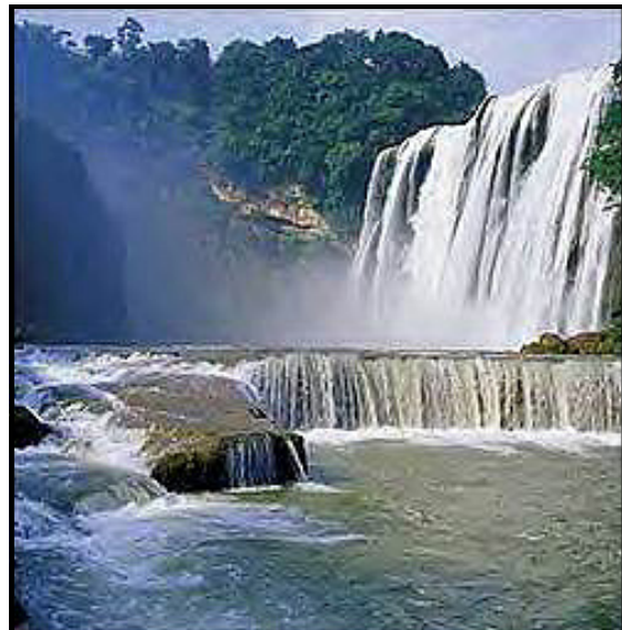
Huangguoshu Waterfall Scenic Area, China

(Excerpted from: http://news.xinhuanet.com/english/2006-05/24/content_4592679.htm >>