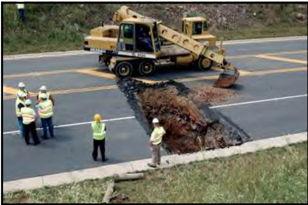
New sinkhole in Leesburg, Virginia.

http://www.leesburg2day.com/current.cfm?catid=6&newsid=12207 >).