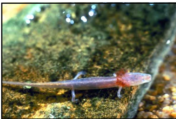
The Barton Springs Salamander ( Eurycea sosorum ), known only from Barton Springs.

(Excerpted from: http://www.statesman.com/opinion/content/editorial/stories/07/5springs_edit.html ).