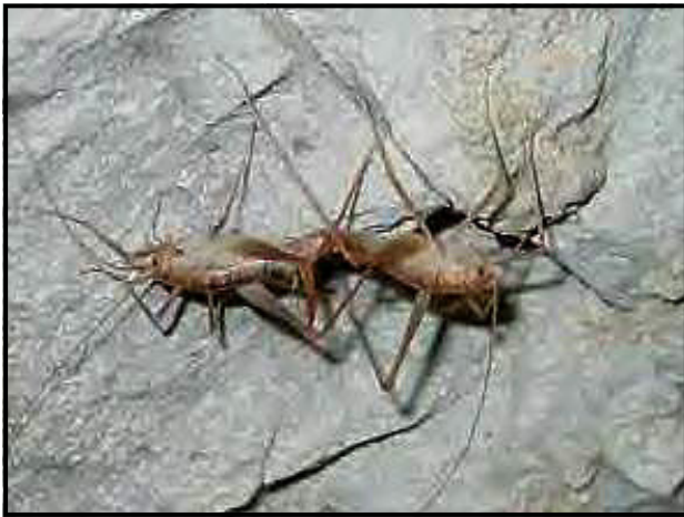
New genus of cave cricket from NW Arizona.

(Excerpted from: Britt, Robert R. 2006. < http://www.live.science.com/animalworld/060505_cricket_genus.html >).